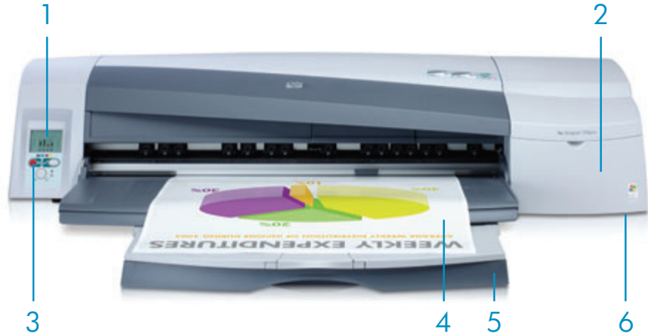
HP Designjet 110plus front shown