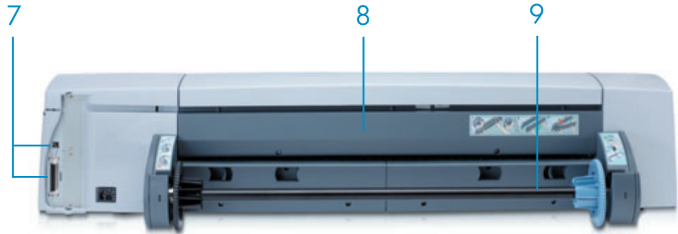
HP Designjet 110plus nr rear shown